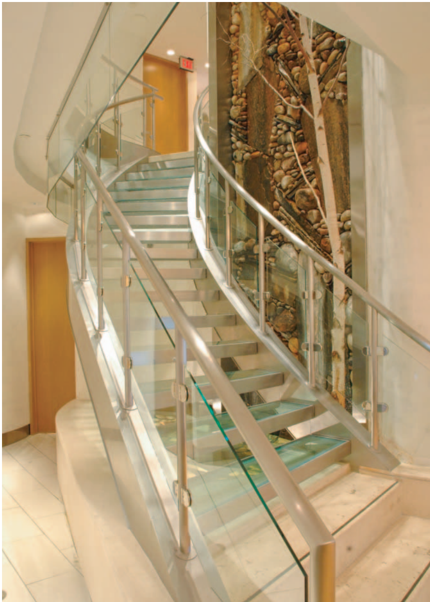
Monumental stainless steel staircase features five different curve radii, glass treads and glass panels