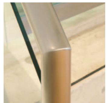
Precision welded and finished guardrail corner