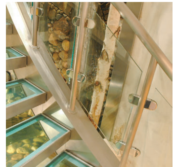
Glass treads revealing pond under staircase