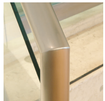
Precision welded and finished guardrail corner