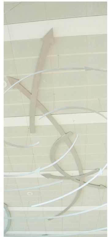
Detail of Intricate Elements of the Sculpture