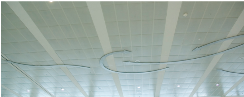
The View of the Front of the Sculpture Facing North