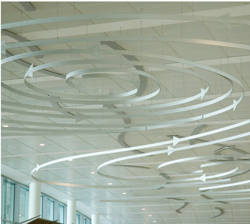
The View Showing the Dimension, Complexity and Depth of the Sculpture