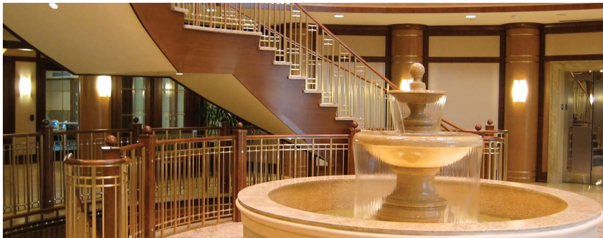
Bronze and wood railing

Highlights - All elements had to be strictly site coordinated to ensure a perfect fit to imperfect field conditions. The result was a great example of Soheil Mosun Limited's reputation as a fabricator that takes tremendous pride in its attention to details.