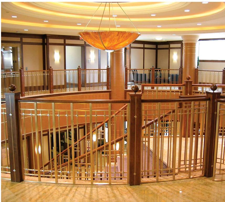
Staircase and balustrades accentuate this foyer beautifully