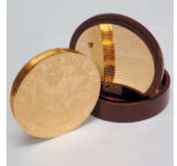
Paperweight with mahogany case

Highlights - The round profile of the paperweight was waterjet cut from 5/8" thick solid bronze plate. The graphics on the outer perimeter were precision engraved using three-dimensional machining technology and the graphics on the front and back faces were acid etched. The paperweight was then brought to a mirror polished finish and then 24-karat gold plated to maintain its luster for many years to come. The accompanying custom case was turned from solid mahogany, making this a true one-of-a-kind piece.