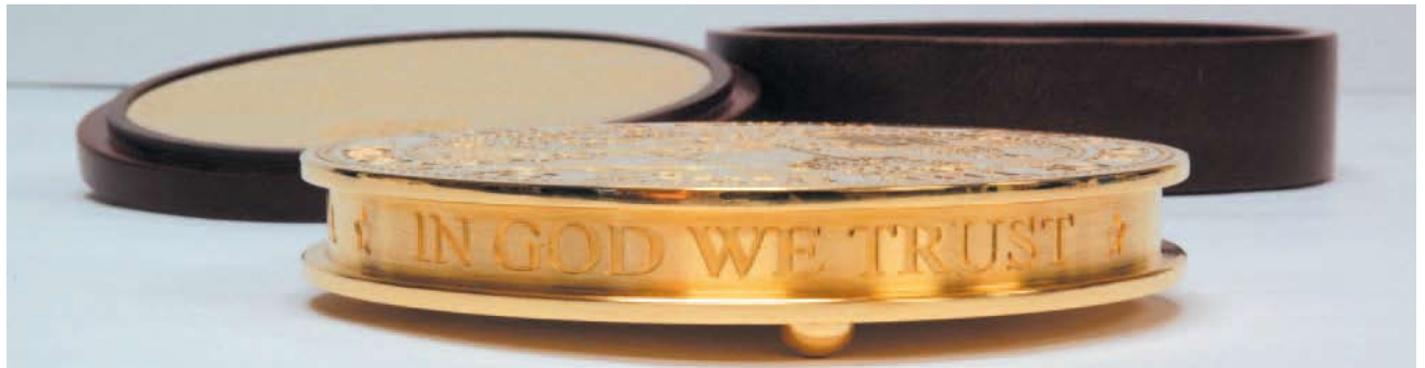
Computer controlled 3D machined graphics on outer perimeter