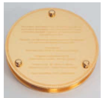
Acid etched graphics on back of paperweight