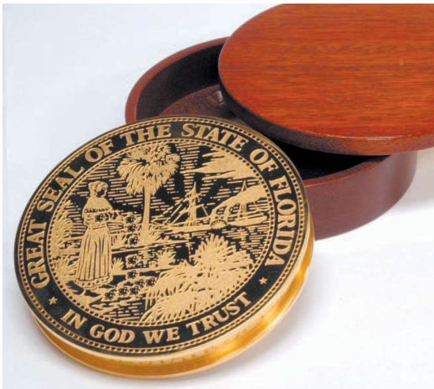
24-karat gold plated bronze paperweight and solid mahogany case