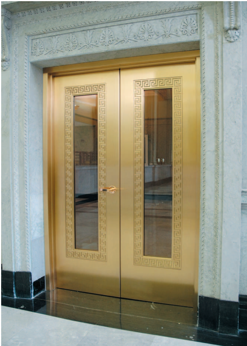
Steel-framed, bronze-clad doors with glass panels