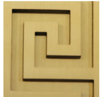
Waterjet cut 1/4" thick bronze motif