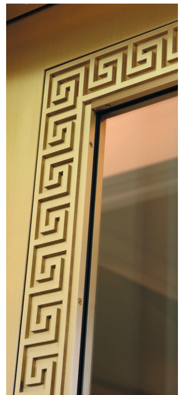
Professionally installed glazing