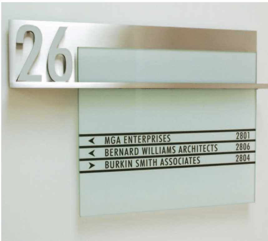
Sleek, bold and very elegant