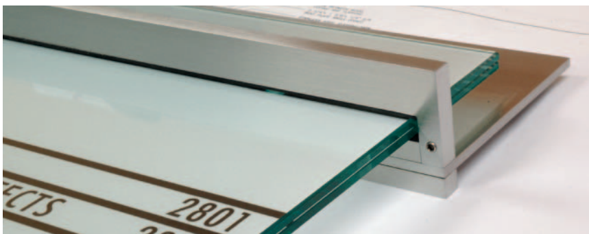
Professional assembly with precision waterjet cut pieces

Highlights - The challenge was to meet the designer's requirement to suspend two tempered glass panels, complete with a changeable vellum graphic insert, without any visible fasteners. Soheil Mosun Limited's ability to collaborate technically with the designer to ensure their vision is achieved in a manner that meets both budget expectations and operational requirements, is one of the many reasons we are a preferred vendor for custom architectural signage.