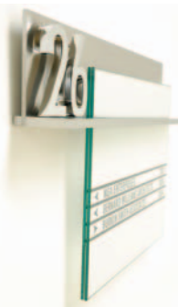
Two suspended glass panels