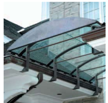
Designed to integrate with existing structure