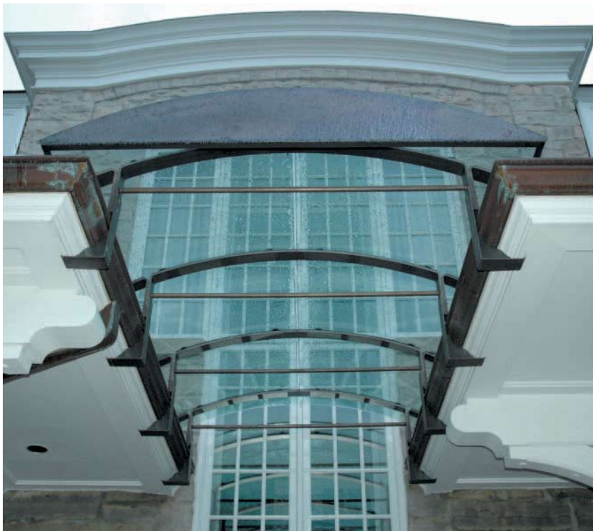
Designed to drain into existing eaves troughs