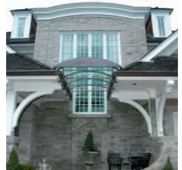
Custom glass and bronze residential canopy