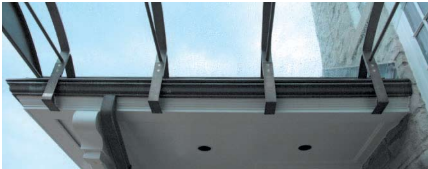
Custom mounting brackets with patina finish

Highlights - Custom glass and bronze residential canopy is made of solid bronze rib supports with patina finish. The canopy was designed to fit onto existing structure and the curved glass allows for water to drain into existing eaves troughs and is laminated for safety.