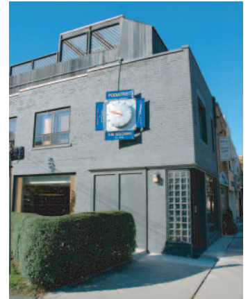
St. stl. exterior clock sign is angle mounted to maximize visibility

Highlights - The clock features non-directional brushed st. stl., with polished st. stl. clock markings. The clock face is accented with 3 ft. long, red clock hands, and a white faceplate ring. The banners are made with blue, weather resistant, vinyl with yellow text. The clock is angled from the building wall to maximize visibility.