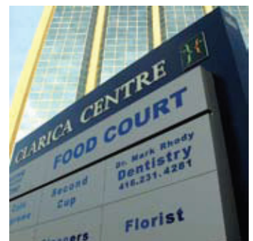
Welded aluminum over steel frame