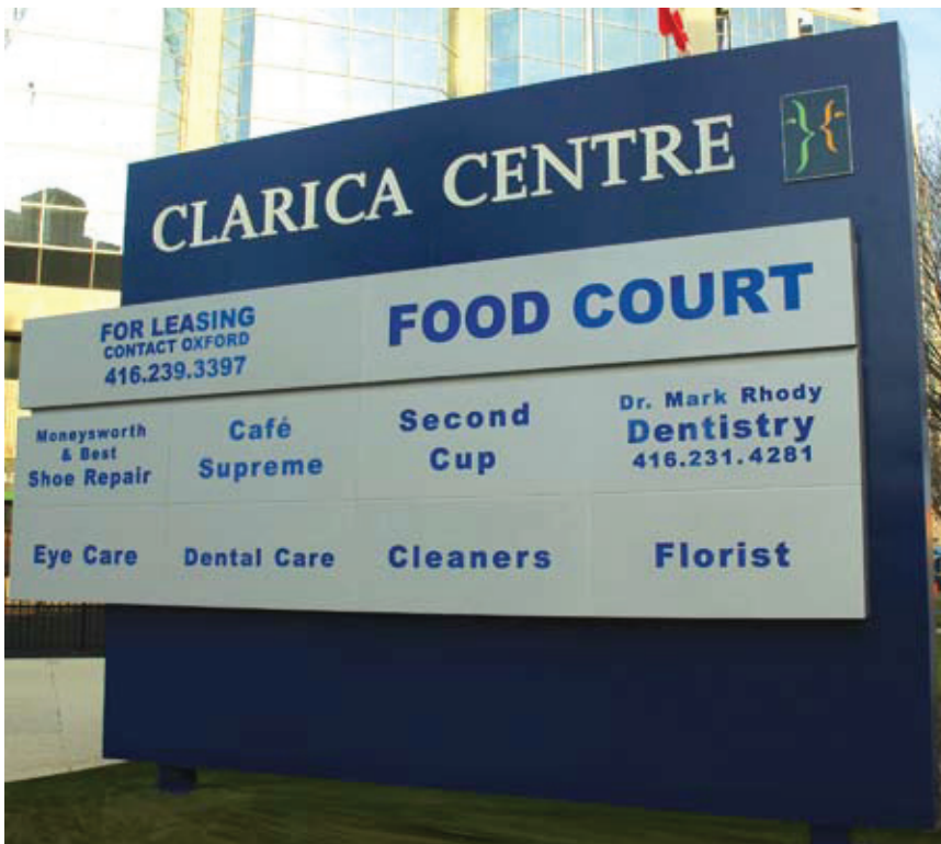
The full sign and directory installed at Clarica Centre