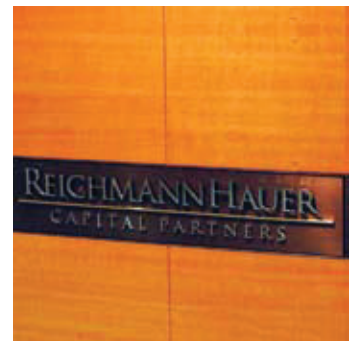
Company identification inlaid into wood panel