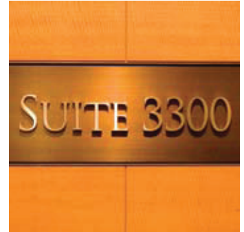
Detail of the stainless steel address identifier

Highlights - The letters were water-jet cut from 1/2" and 1/4" thick stainless steel sheet, then combination finished; utilizing both mirror and brushed treatments. The 1/4" square bronze divider line was also brought to a mirror finish, then 24 carat gold plated. All graphics are pin mounted to the solid bronze panel which has been patina finished to its deep chocolate colour.