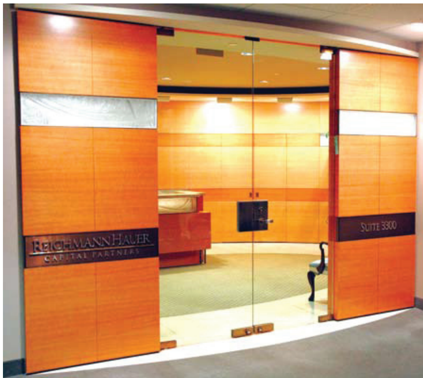
The finished result provides a beautiful and highly professional look to this entranceway