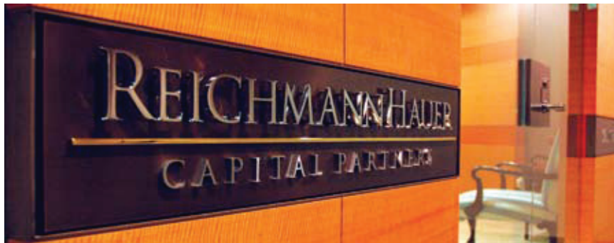
High quality mirror polished finish accented with 24 carat gold plated bronze divider