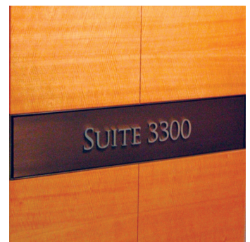
Address identification inlaid into wood panel