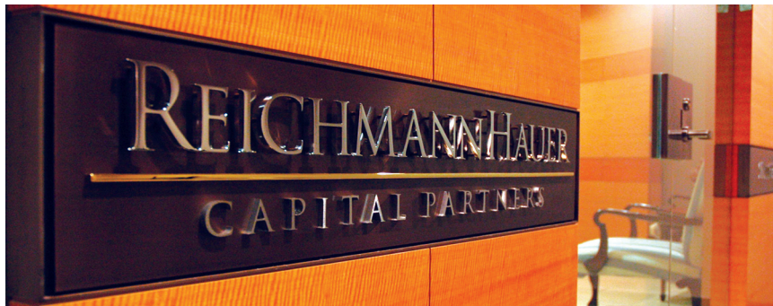
High quality mirror polished finish accented with 24 carat gold plated bronze divider