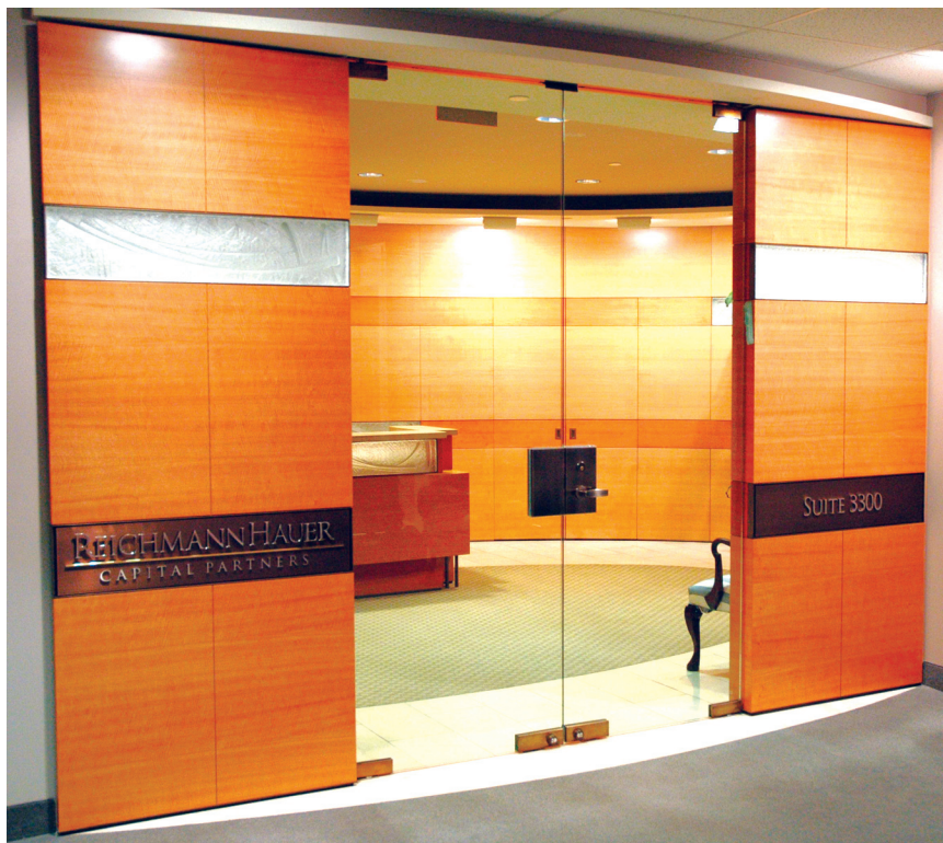
The finished result provides a beautiful and highly professional look to this entranceway