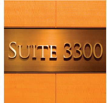
Detail of the stainless steel address identifier

Highlights - The letters were water-jet cut from 1/2" and 1/4" thick stainless steel sheet, then combination finished; utilizing both mirror and brushed treatments. The 1/4" square bronze divider line was also brought to a mirror finish, then 24 carat gold plated. All graphics are pin mounted to the solid bronze panel which has been patina finished to its deep chocolate colour.