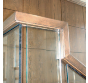
Close-up of solid oak top rail

Highlights - The spiral railing design features faceted clear 1/2" thick tempered glass panels with polished edges and painted aluminum risers and shoes. The curved top rail was made from solid oak and stained to match existing wood trim and paneling.