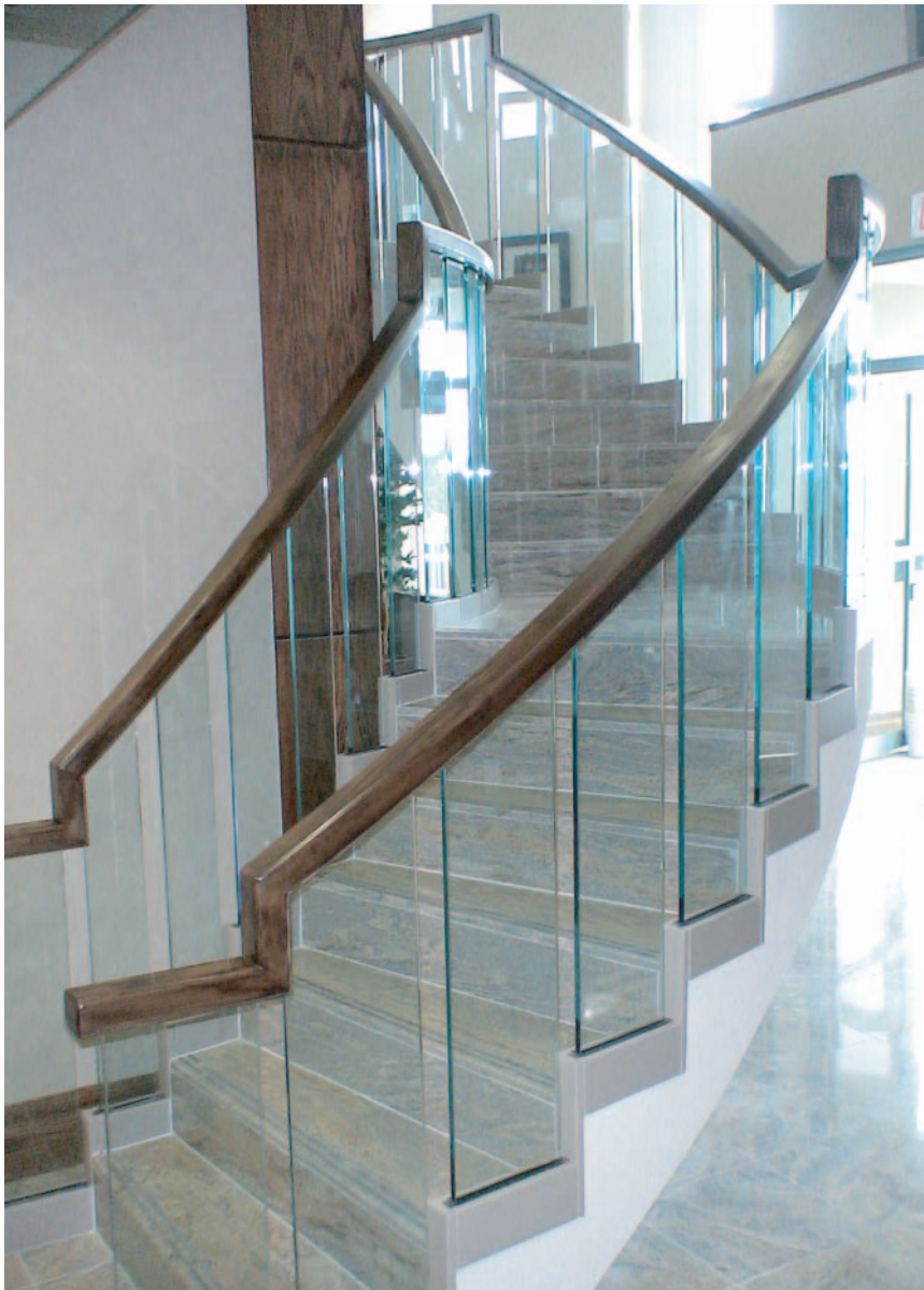
Clear tempered glass panels, painted aluminum risers and shoes, and a curved oak top rails