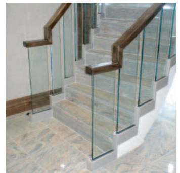
Tempered glass panels and solid oak top rails