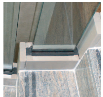
Structurally engineered glass shoes and risers