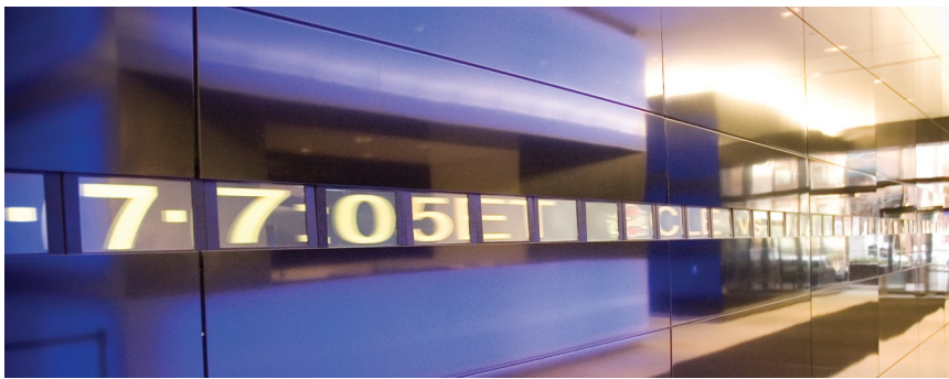
LCD Ticker Display runs the length of the wall