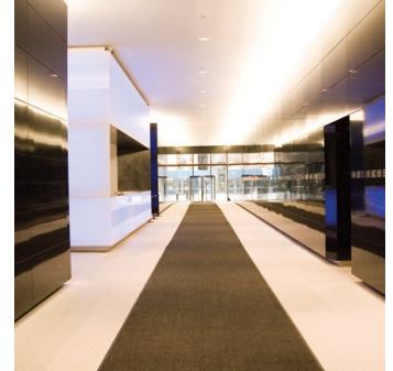
High gloss black clad walls

Highlights - Aluminum wall framing system is complete with .25" thick black painted wall panels with .25" wide x .25" deep, horizontal and vertical reveals, mounted to the framing system which is fastened to the existing wall finishes in the lobby. An LCD stock ticker display runs the length of the wall opposite the reception desk. The reception enclosure is a stand alone white painted steel framing system with horizontally mounted brushed stainless steel bars at each course that supports structurally siliconed 9/16" low iron laminated translucent glazing panels on the outside faces with a back-lighting system of T5 fluorescent fixtures along with removable white painted aluminum panels including tamper proof screws on the inside wall and ceiling surfaces. Brushed stainless steel clad surfaces surround the transaction openings at both sides of the light box including the counter, ceiling panels above and the flanking diagonal panels.