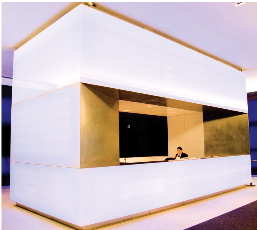
Internally illuminated reception enclosure accents the glossy black panels of the wall cladding