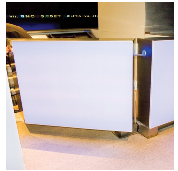
Custom internally illuminated security entrance