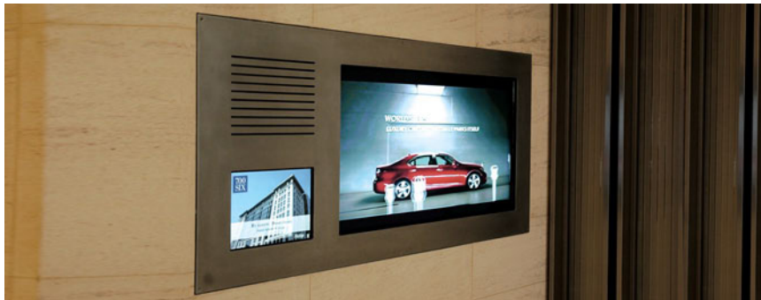
The touch-screen lobby directory