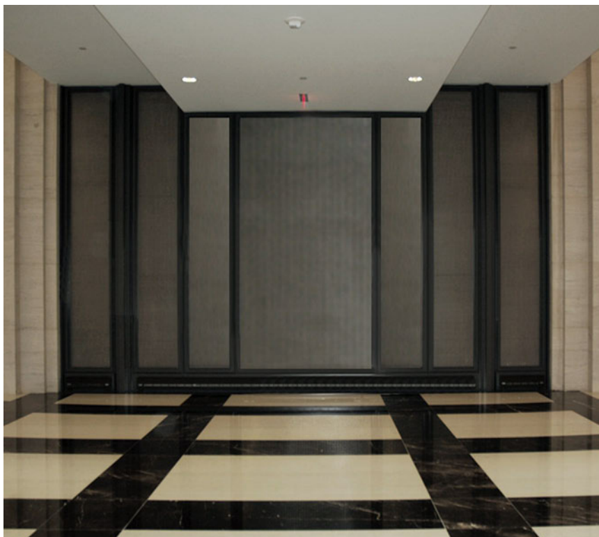
Center set of custom air intake louvers