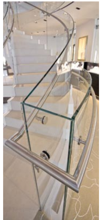
Detail of the custom handrail