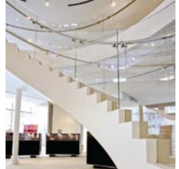
Detail of balustrades and railings

Highlights - Set in the center of the store, this staircase spirals in two continuous 180 degree half circles, through three levels to a height of 28'. The rolled and reinforced HSS primary stringer structure was engineered to support the substantial loads imposed by the 1 1/2" thick polished white limestone treads and risers, the seamless white plaster cladding at the edges and underside as well as the curved, tempered, Starfire glass guardrails. The matching balustrade glass and smoke baffle glass enclose the 16' diameter floor openings while the rolled, welded and seamless 1 1/2" diameter brushed stainless steel handrails and brackets provide support and continuity.