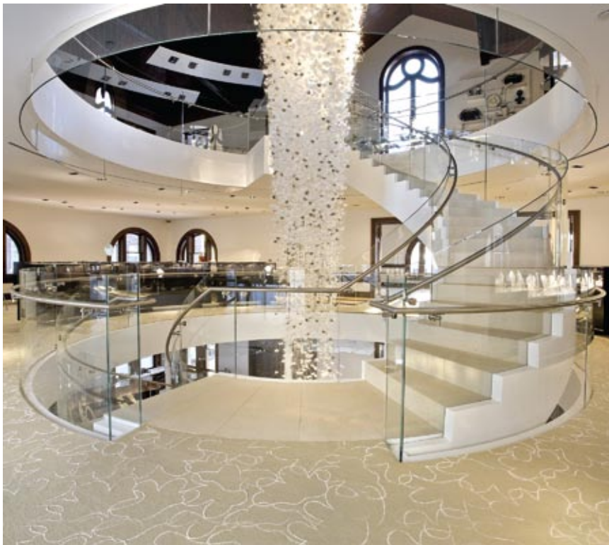
The monumental spiral staircase in-situ at the OC Tanner flagship store