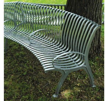
End and curve detail

Highlights - The bench is made of steel gables for the support structure and rolled ribs with custom rolled and fit arm rests. The bench was then powder coated with a metallic silver finish suitable for exterior applications. Ribs are 1/4" roll formed steel. Arm rests are 1/2" roll formed steel. This design has particular attributes which are attractive to parks departments, namely the bench acts as a tree trunk protector. (Actual location of Peter Minuit Plaza not shown).