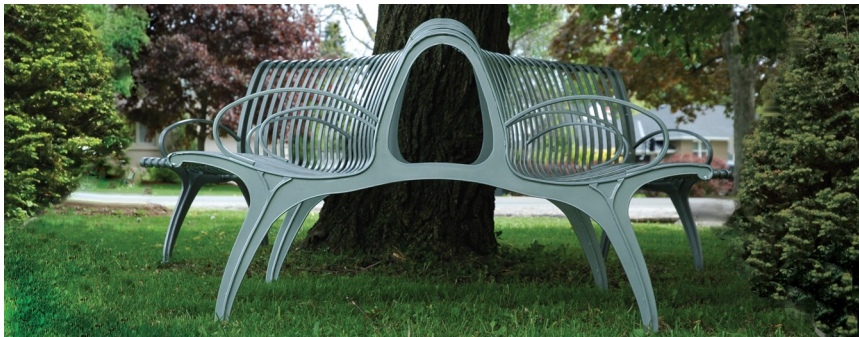
Straight on view of the closed end of the zipper bench