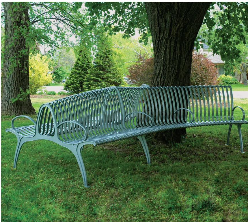
The zipper bench nestled against a tree