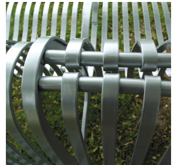
Detail at the convergence point