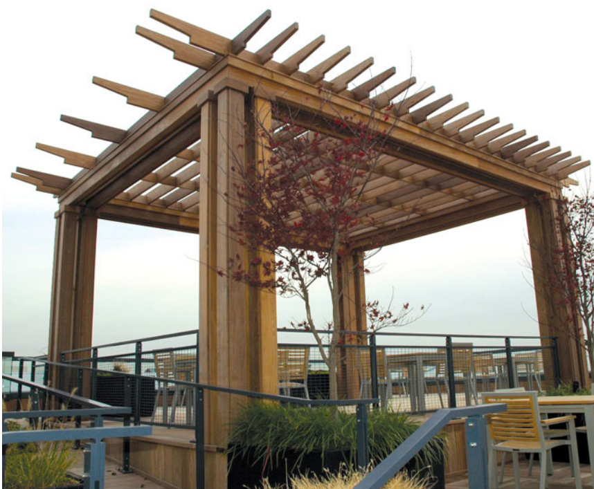
Rooftop railings surround the entire space