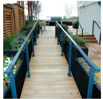
Ramp and stair handrails