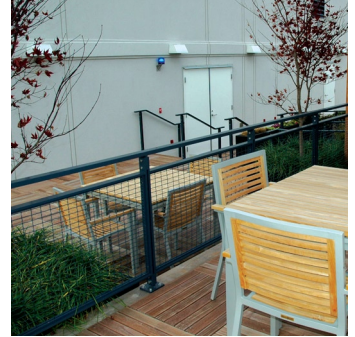
Railing and mesh

Highlights - The railings were fabricated using extruded aluminum tube, wire mesh and plate then painted in a UV stable powder coated finish. All hardware is stainless steel. In January 2010, SML was selected the winner of the Washington Building Congress Craftsmanship Award® which recognizes SML's outstanding skill and achievement on its scope of work for the 700 Sixth Street NW project.