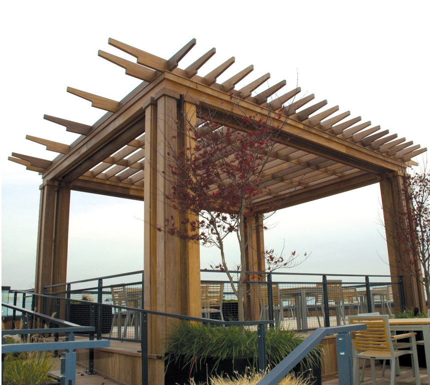
Rooftop railings surround the entire space