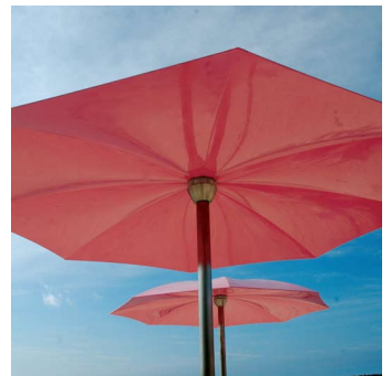
Detail from beneath the beach umbrella