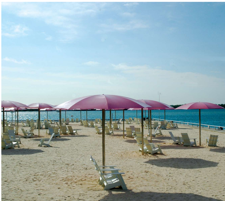
View of the beach umbrellas facing Lake Ontario