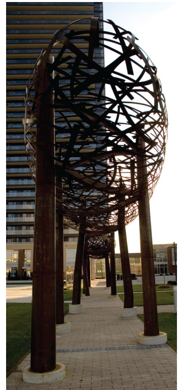
A perspective view of the sculptures