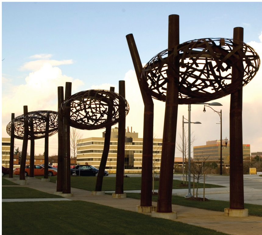
Summer Clouds Sculpture at Concord Park Place in Toronto