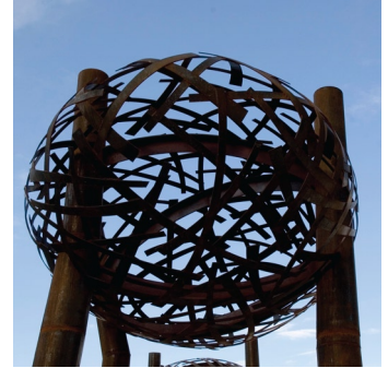
View of the top portion of one of the sculptures

Highlights - Constructed of Corten steel, the largest of the three (3) sculptures is 51' long, 17' high and 11' wide. The second largest of the trio is 20' long, 17' high and 11' wide. The third and smallest of the three is 15' long, 17' high and 11' wide. The sculptures themselves are comprised of waterjet cut plate of Corten steel at .25" thickness and welded. The legs of each sculpture are rolled and then seam welded to give a tree trunk look to the finished sculptures. These sculptures are virtually maintenance free.