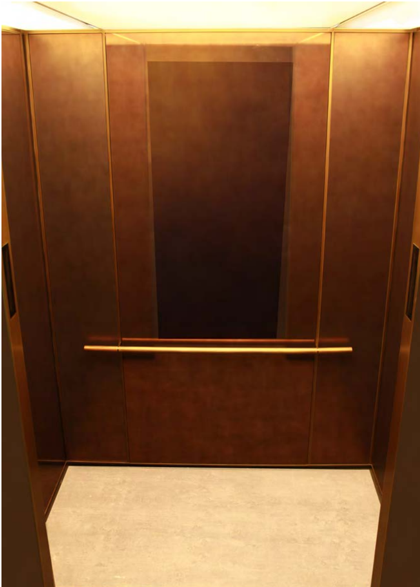
The back and side walls of glass and bronze with patinated bronze railing shown.