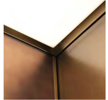
Detail of upper corner of cab

Highlights - The elevator cabs feature acid etched laminated glass wall panels with antique bronze reverse painted finish, laminated to honeycomb aluminum. The glass emulates the bronze clad door, COP and front return panels, which are all patinated to an architecturally approved finish, then coated with a matte lacquer. The ceiling panels are fabricated 1/4" acrylic removable pans. Hand rails are orbitally finished, then patinated and lacquered.