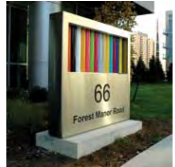
Custom building identification sign

Highlights - Main entrance art installation is a 60'-0", 60" in diameter at the base tapering to a 3" diameter at the top with three (3) more cones that are 48'-0" high, 48" in diameter at the base tapering to 3" diameter at the top through the central plaza area of the development. As well, there are six (6) cylinders, three (3) of which are 36'-0" high, 24" in diameter. Another cylinder at 48'-0" high, 36" in diameter is located at the community center within the development. All building entrance signs include the colourful design elements of the cones and cylinders. Soheil Mosun Limited Riverbenches™ are placed throughout common areas on the grounds. All cones and cylinders are fabricated from 1/4" thick "boat hard" fiberglass painted in 24 different colours using exterior grade UV resistant paint finish along with an interior galvanized steel structure.