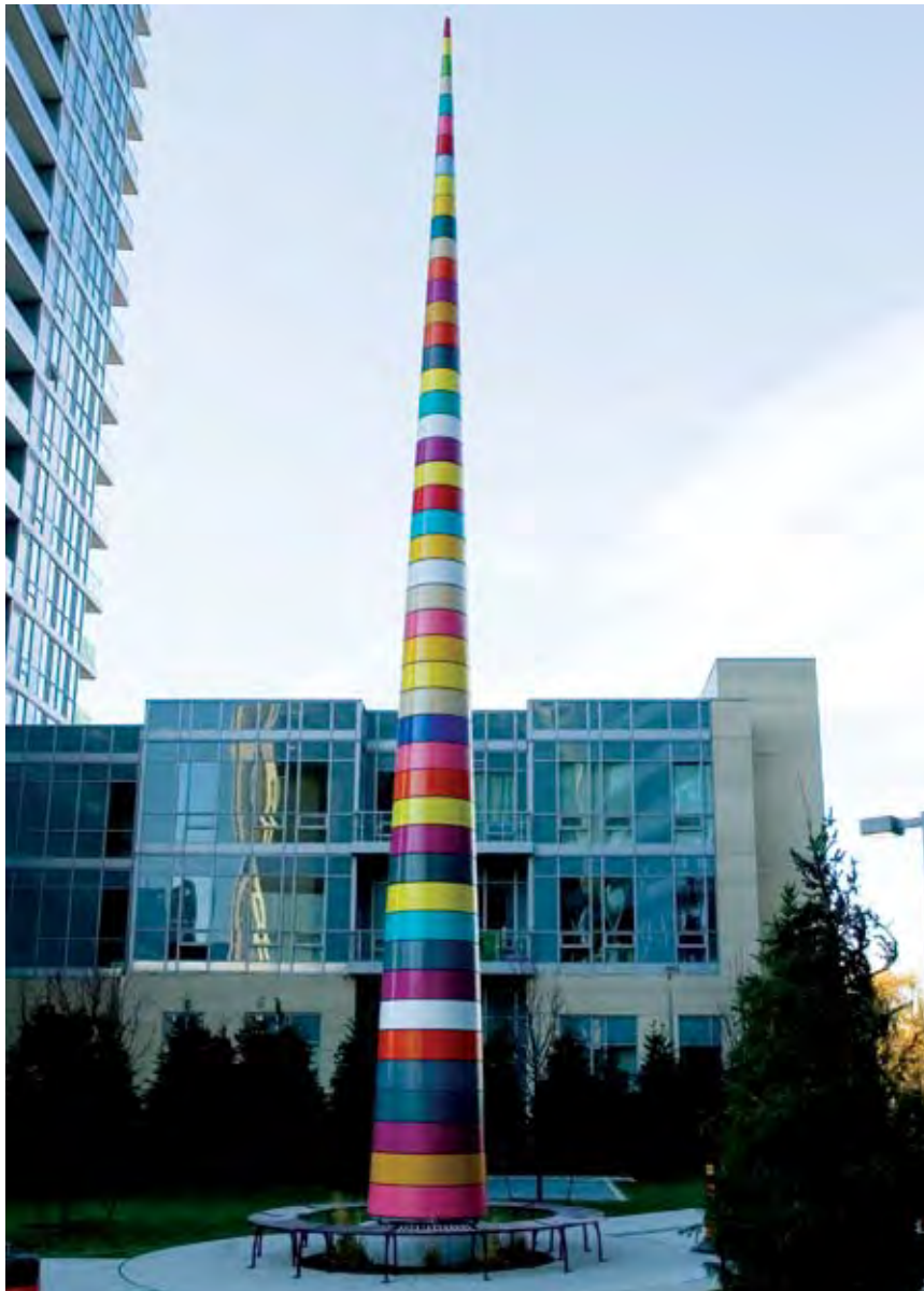
One of the 48'-0" cones with a wrap-around Riverbench™ located in the central exterior common area.