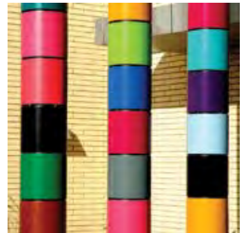
Detail of three (3) of the 24' cylinders