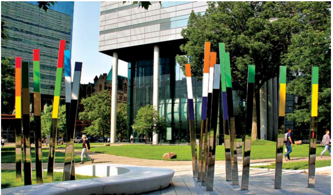
The Franco Ontarian Monument at Queens Park in Downtown Toronto