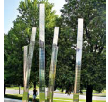
Bead blasted patterned side of the staves

Highlights - This monument is comprised of a series of (15) mirror polished and bead blasted patterned staves made of alloy 316 stainless steel rectangular tubing. Each staff is approximately 12' in height and the monument includes a mirror polished (with LED) diffused acrylic lens lit sign describing the monument and its meaning with an embedded stainless steel name plate in the seating area entrance. On the opposite side of each staff are 3M vinyl strips with varied colours honouring the Franco-Ontarian community which dates back more than 400 years.