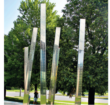
Bead blasted patterned side of the staves

Highlights - This monument is comprised of a series of (15) mirror polished and bead blasted patterned staves made of alloy 316 stainless steel rectangular tubing. Each staff is approximately 12' in height and the monument includes a mirror polished (with LED) diffused acrylic lens lit sign describing the monument and its meaning with an embedded stainless steel name plate in the seating area entrance. On the opposite side of each staff are 3M vinyl strips with varied colours honouring the Franco-Ontarian community which dates back more than 400 years.