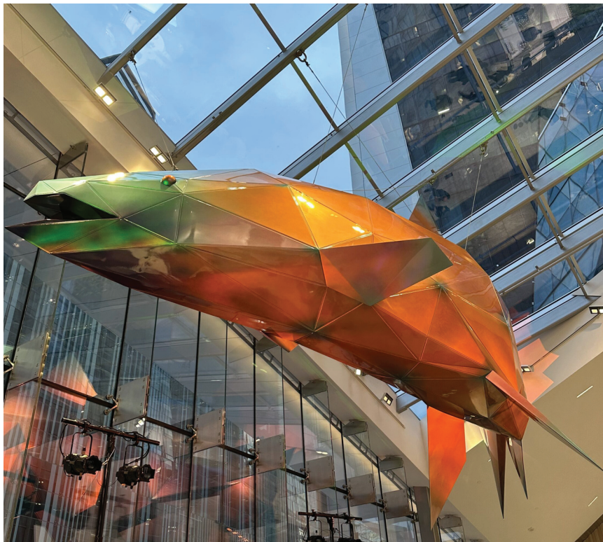
"Spawn" as viewed from below within the atrium of Vancouver Centre II

Highlights - Custom suspended Salmon sculpture, approximately 30'-0" long x 13'-8" high, fabricated from .090 thick stainless steel with a multi-colour Chameleon effect paint finish. Custom suspension system comprised of steel cable and custom made stainless steel mount and gromet system, and is installed approximately 15' from the floor.