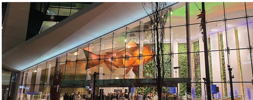
"Spawn" as viewed from the exterior at street level