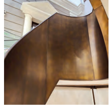
Detail of interior curved bronze cladding

Highlights - Structural steel staircase clad with SML-C3 patinaed muntz bronze inside and outside of stringers. 168' of railings are patinaed bronze and secured with custom built fasteners secured to posts and glazing. Structural steel components were 3D modeled and templated in shop and shipped to Bermuda for installation. Cladding is .050" Muntz Bronze cut and formed to the staircase. Stone treads and risers are comprised of white marble.