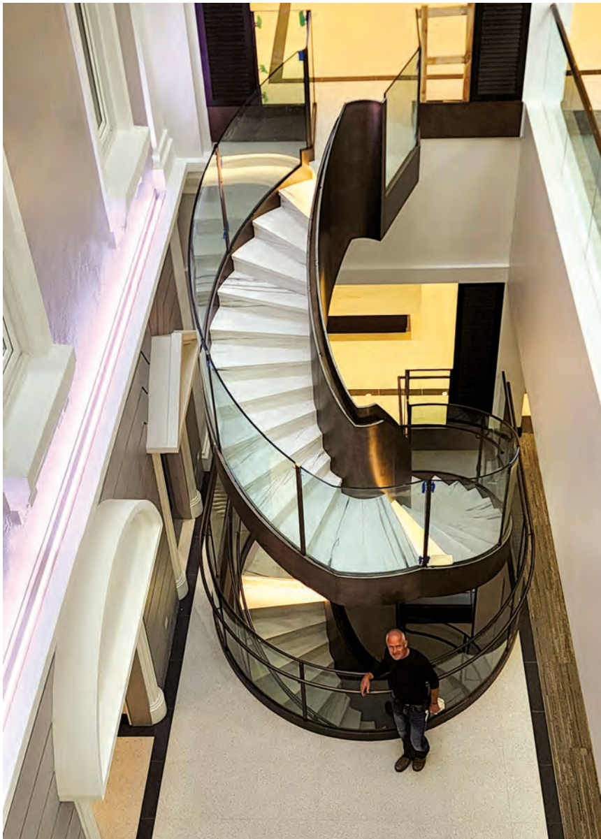
The three (3) story elliptical bronze clad staircase with patinaed railings and custom glazing.