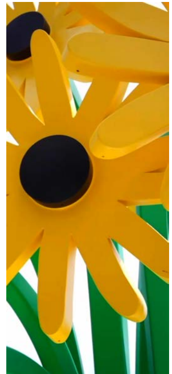
Detail of the petals pistils and stems