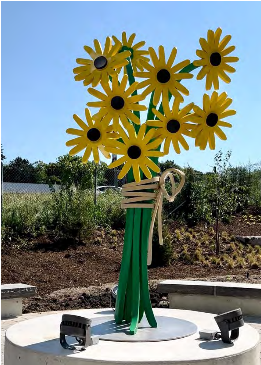
The Selfie Susans public art sculpture in-situ at Block 11 of Concord Park Place