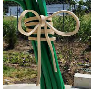
Detail of the bow on the sculpture

Highlights - The sculpture is made of stainless steel that has been specially painted and coated. It is 10' in height covering an area of 5' square overall. There are three (3) unique flower head designs which are 20" in diameter, making nine (9) flower heads altogether. The pistil stems of the flowers are 1.7" in diameter painted stainless steel pipe. The circular pistil diameter is 4.4". The bow rope wrapping the flowers is 1" diameter painted stainless steel. The sculpture includes a stainless steel base plate, 1/2" thick and 48" in diameter. This is then set on a concrete plinth adding more height to the sculpture.