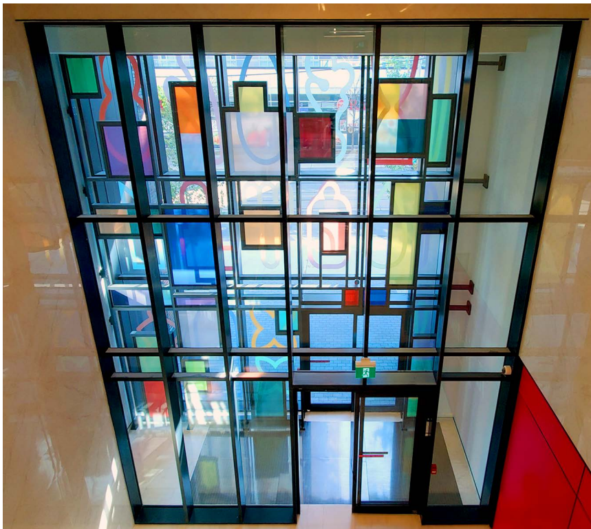
The Artworks Tower as viewed from the elevator lobby mezzanine at 688 Dundas street