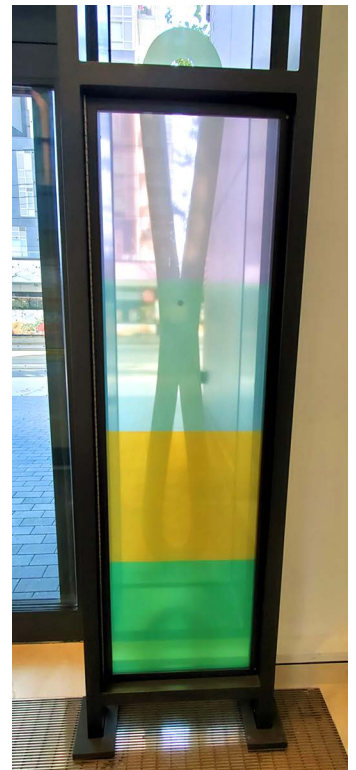
Detail of multi colour glass and embedded frame