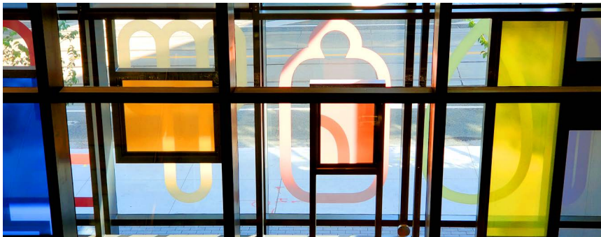
A mid-level view of the street through the Artworks Tower from the interior