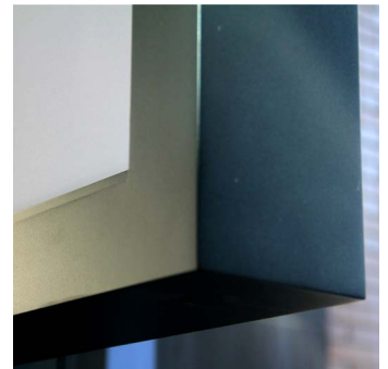
Detail of the seamless painted framework